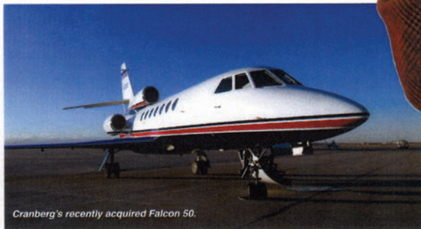
Cranberg's recently acquired Falcon 50.